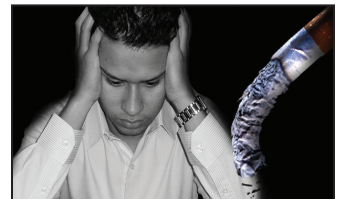
FUMAR PUEDE CAUSAR IMPOTENCIA