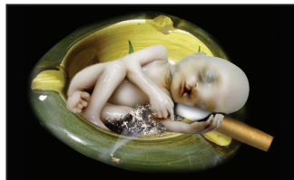
FUMAR PUEDE CAUSAR ABORTOS