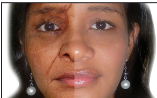
FUMAR PUEDE CAUSAR ARRUGAS PREMATURAS