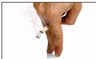
FUMAR CAUSA IMPOTENCIA