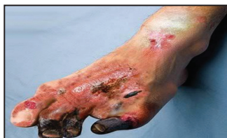
FUMAR CAUSA GANGRENA