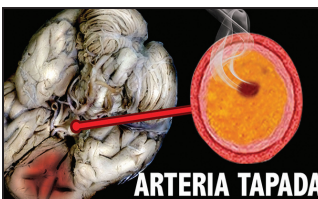
FUMAR PUEDE CAUSAR ENFERMEDAD CEREBROVASCULAR