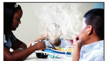
EL HUMO DEL TABACO AJENO DAÑA LA SALUD FAMILIAR