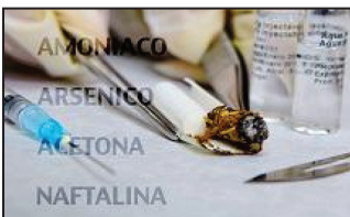
LOS COMPONENTES DE LOS PRODUCTOS DEL TABACO CAUSAN ENFERMEDAD Y MUERTE